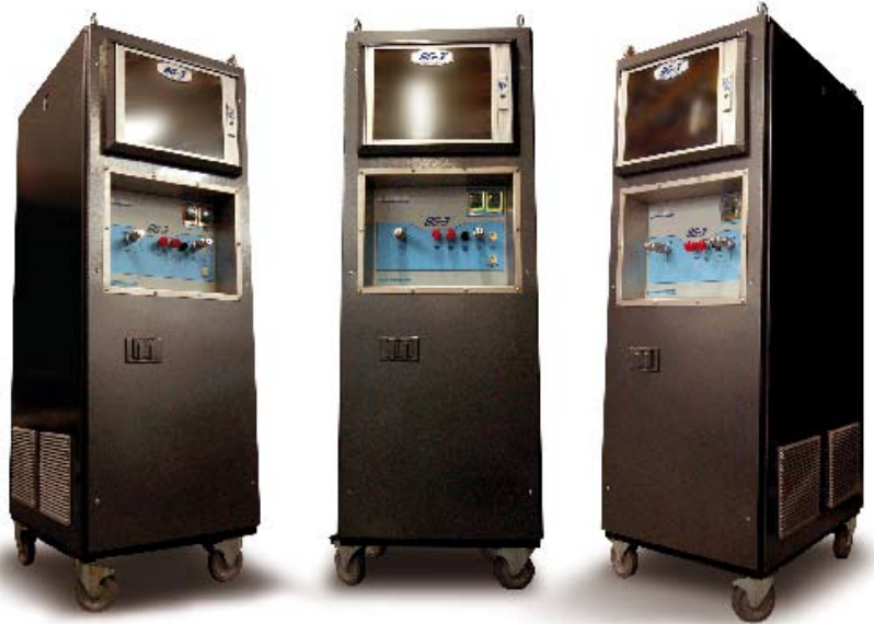
BG-3 particulate, partial flow, sampling system that provides high levels of accurate technical output

Second, CVS tunnels tend to be quite expensive. A typical installation able to handle engines of up to 600bhp has a 457 to 610mm diameter and length between