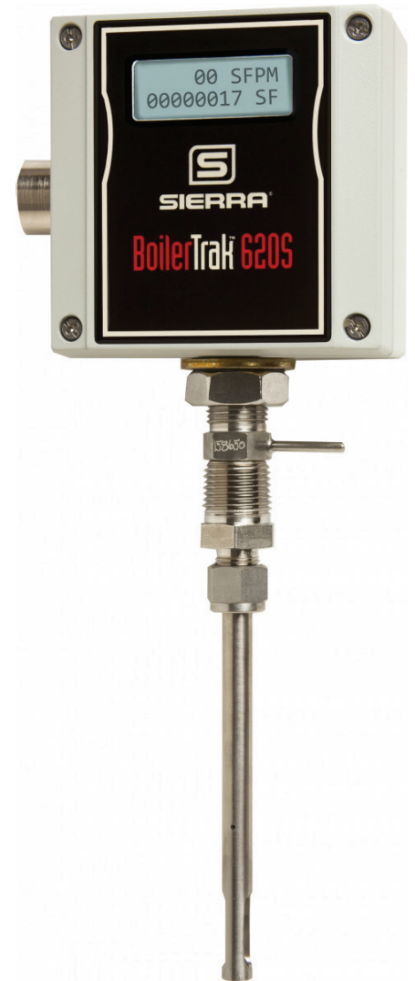
Figure 2: BoilerTrak™ 620S-BT Thermal Mass Flow Meter For Inlet Fuel Flow Measurement

To efficiently tune a boiler, three key measurements must be taken: air and fuel inlet flow, feed water flow, and steam output (See Figure 1).