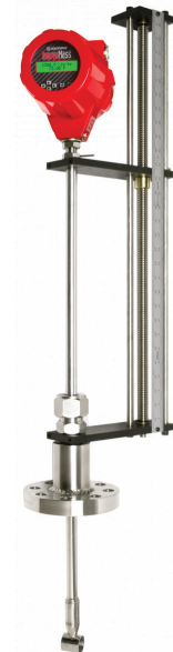
Figure 4: InnovaMass 241i Vortex Flow Meter For Outlet Steam Measurement