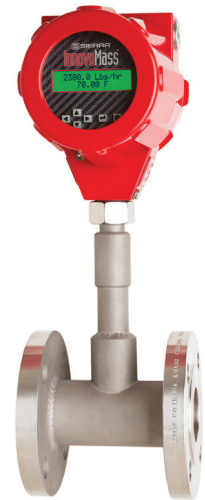
Figure 3: InnovaMass 240i Vortex Flow Meter For Feed Water Flow And Outlet Steam Measurement

Learn more at sierrainstruments.com/boilermact